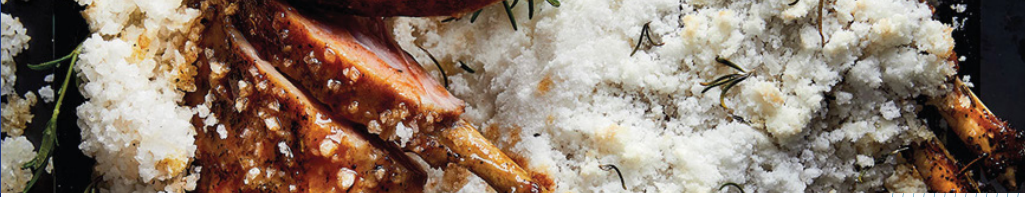
Table Sea Salt